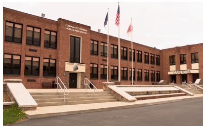
Happy 85th birthday Conemaugh Township!