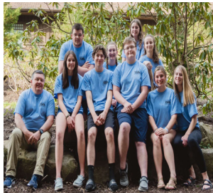
TSA at this year's State Championships.