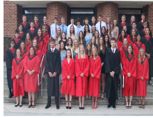
NHS members at this year's ceremony.