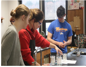
Chem I students performing a lab.