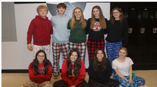
PJ Spirit Day!