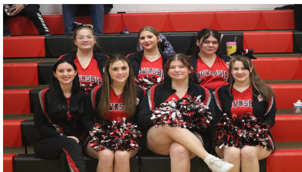
CT cheer supporting our basketball teams!