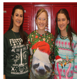
Ugly Christmas Sweater Day!