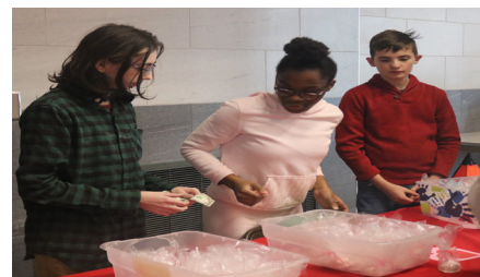
Cafe 118's cake pop sale was a hit!