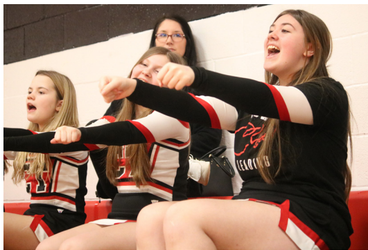
Cheering on our junior high girls basketball team.