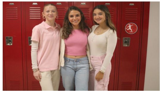
Happy Valentine's Day!