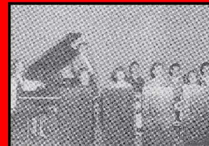
The Jazz Band The members join together to play.