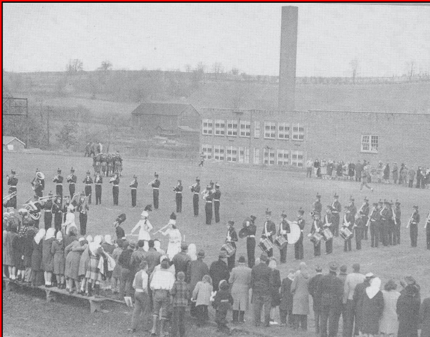
Marching Band The band plays loudly for all to hear.