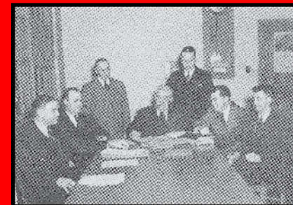
Leaders of C.T.H.S. The Board of School Directors of Conemaugh Township are hard at work.