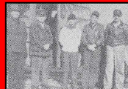
Providing Transportation The bus drivers join for a group picture.