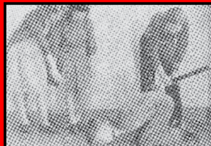
Photography Club The group joins together to pose for a group picture.