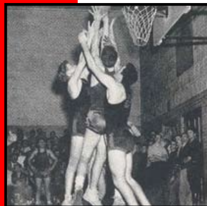
Jump High The Indian Basketball Team members fight for the ball and hope for a rebound.