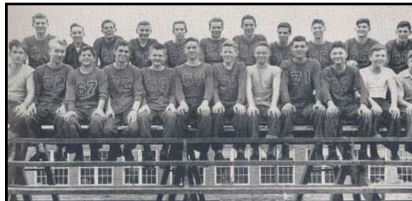
In the Stands The Conemaugh Township Football Team gets together for a team picture.