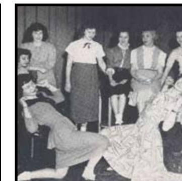
Time Out The cheerleaders gather for a non-formal picture.