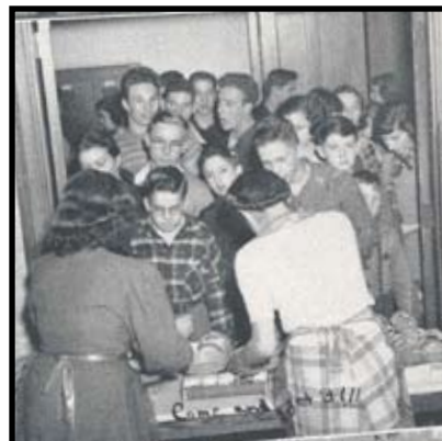
Out of My Way! The Students hurry to get to the front of the line.