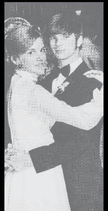
Rome After Dark Two students enjoy dancing at the Prom at the Indian Lake Lodge.