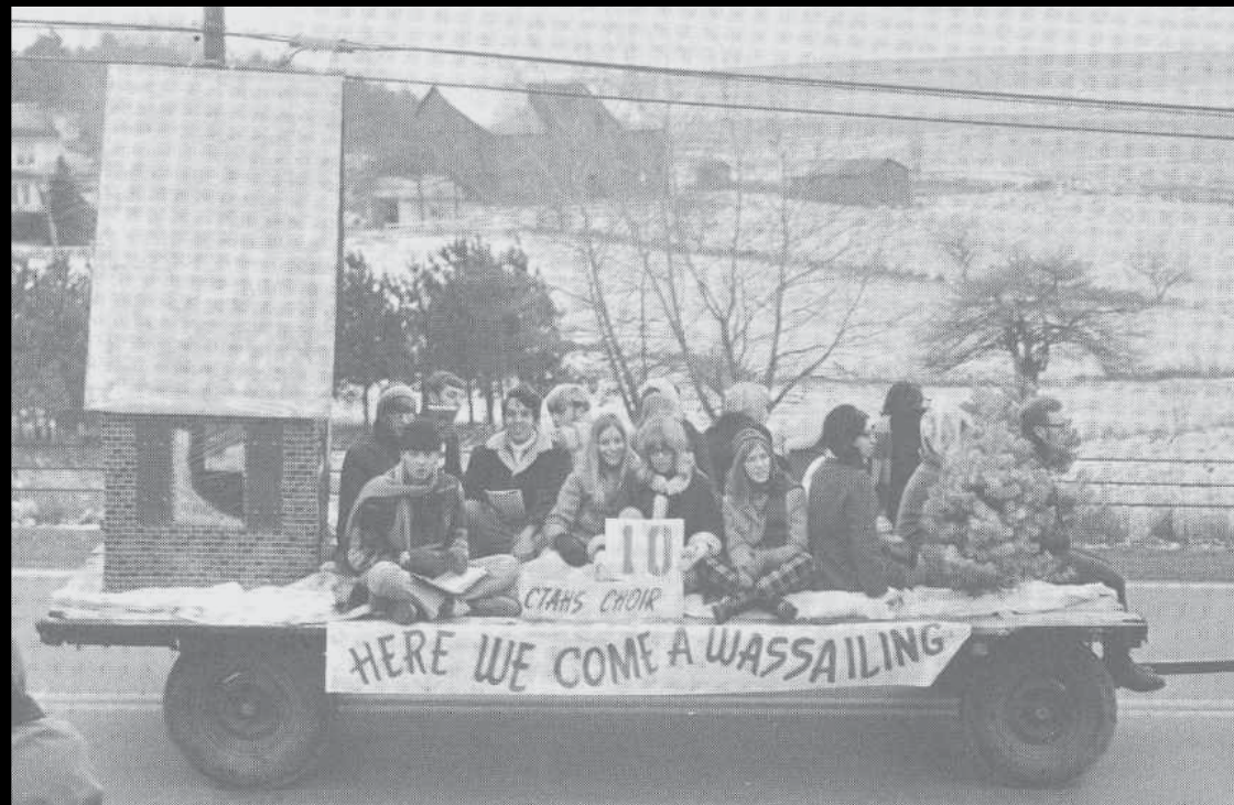
Holiday Float Students take a break from school to participate in a parade.