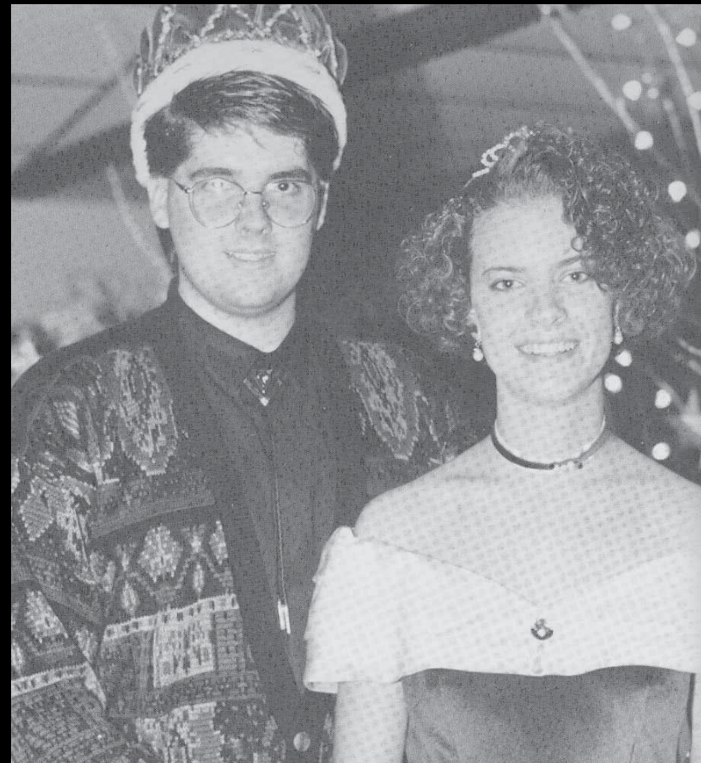
Magical Moments The 1991 Christmas Dance is sponsored by the Sophomore Class.