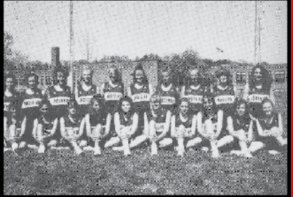
Running Sensations The girls' track team had a great season.