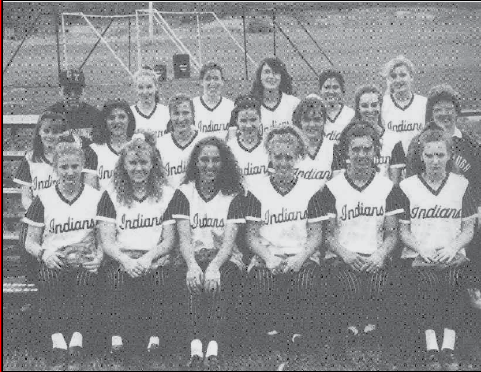
Softball Ladies The varsity softball team shows what it takes.