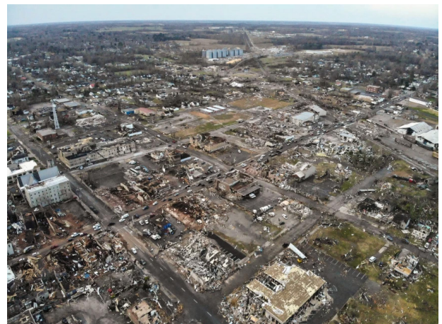
The tornado aftermath in Mayfield, Kentucky

Countless homes have been destroyed and countless families have been torn apart. There is currently a fund that will be used to pay for the funerals of all the people who died. As of Dec. 14, 2021, the fund has accumulated almost $10 million.