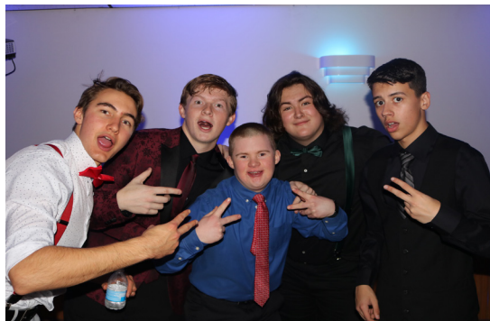
Group of boys tear up the dance floor at the Christmas dance.