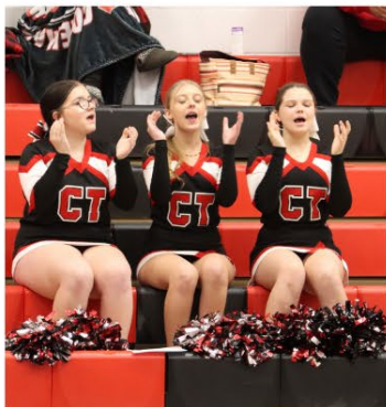
Our junior high cheerleaders leading the crowd!