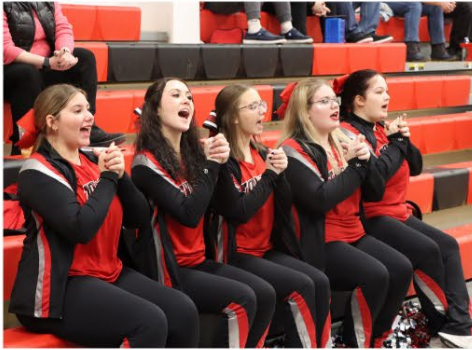
Our varsity cheerleaders cheering the way to victory!