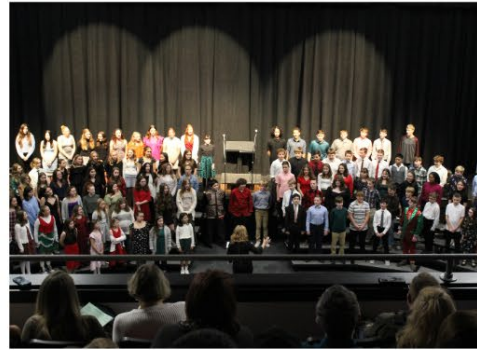
Middle school winter concert!