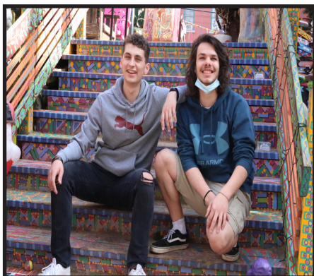
Art club goes to Randyland in Pittsburg for an artistic adventure!