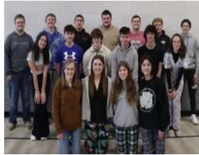
Our Heritage competitors