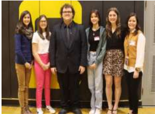
Impromptu Speech team at the Heritage Conference