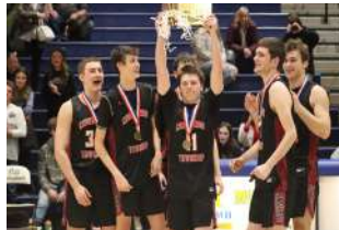
Our boys basketball celebrating their District 5 Championship win