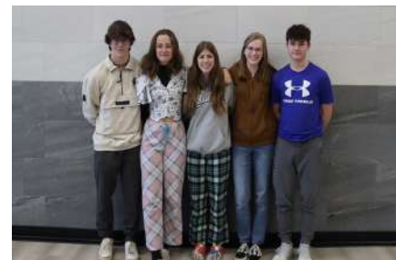
Heritage math competition 2nd place winners from the Heritage Academic Competitions

The new Heritage will include a total of 12 teams in the new year of 2023. Those schools include: Cambria Heights, Homer-Center, Marion Center, Northern Cambria, Penns Manor, Purchase Line, River Valley, United, Portage, Conemaugh Township, Conemaugh Valley, and West Shamokin.