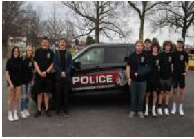
Dodgeball organizers with our local law enforcement