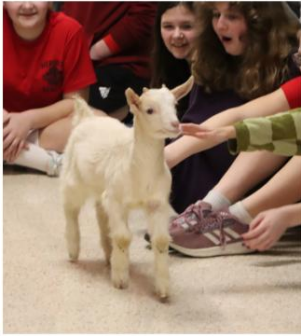
6 th graders have a visitor!