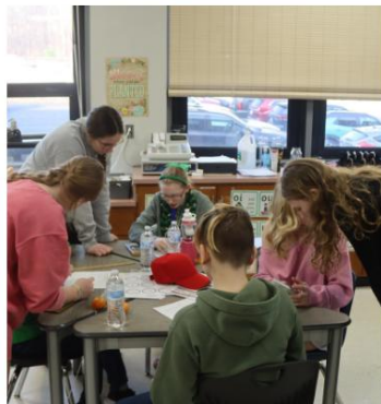
Pi day celebrations.