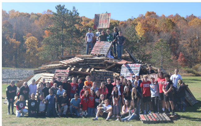
Our senior class with their 2022 Bonfire