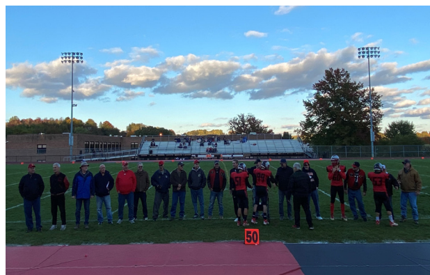
1972 CT football team & family