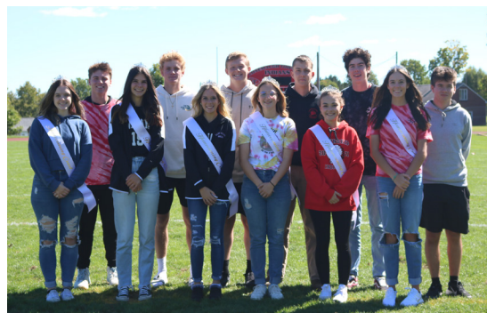
This year's 2022 Homecoming Court.